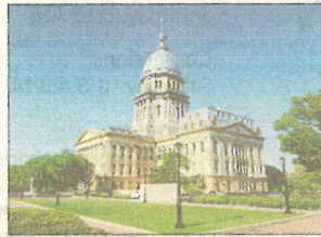
Illinois' EOLA Act was passed in October 2025 and signed into law by the governor in December.

During debates last spring, advocates from other states, including Oregon, said there has been no evidence of discriminatory use of the procedure.