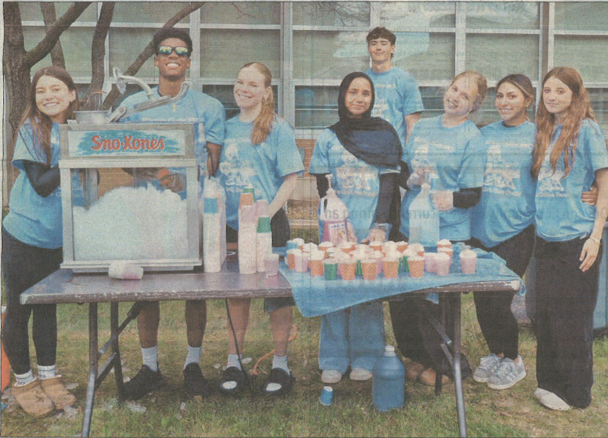
On May 13, Willowbrook High School's Positive Behavioral Interventions and Supports (PBIS) team hosted its annual end-of-year barbecue. The PBIS program was implemented in 2007 to teach Willowbrook students expected behaviors and rules, and what it means to be a Warrior and embody the Warrior Code. The goal of the program is to develop a positive school climate through creating common language and standards, and the barbecue is a time to celebrate improved behaviors at Willowbrook. Staff and students volunteered during the event, which featured music and tasty treats. The school's Class of 2026 celebrated its commencement on May 17. Willowbrook's freshmen, sophomores and juniors finished their 2025-26 school year with semester exams from May 20-22.