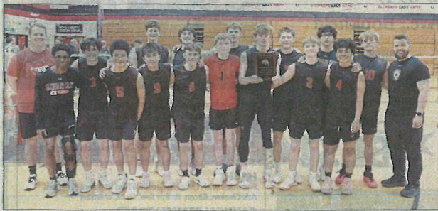
Glenbard East's boys volleyball team took second place in its 16-team Springfest Invitational on Saturday. The Rams won their first four matches to advance to the championship contest against Glenbard West. Glenbard East won the opening game, but the Hilltoppers rallied to earn a 23-25, 25-19, 25-22 victory. Glenbard West moved to 10-0 with the win, while Glenbard East dropped to 12-1.