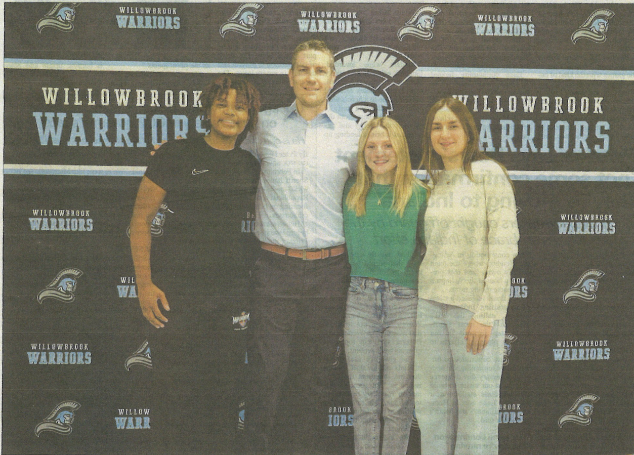
SUBMITTED PHOTO Villa Park Review