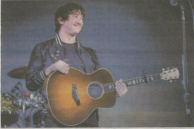
Villa Park Review

VOL. 22 · NO. 8 WWW.THEINDEPENDENTNEWSPAPERS.COM THURSDAY, FEB. 5, 2026