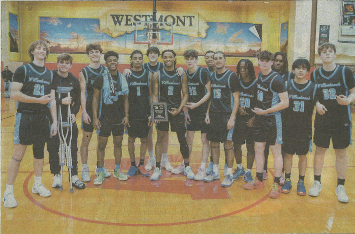
CHRIS FOX PHOTO Villa Park Review