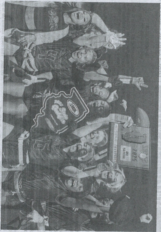
Willowbrook celebrates the win over West Aurora at the Sectional final on Tuesday, Oct. 14, in South Elgin.