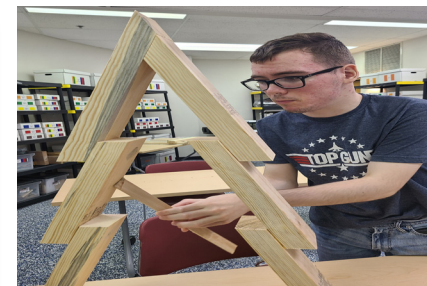
PROVIDE OPPORTUNITIES FOR STUDENTS WITH SPECIAL NEEDS