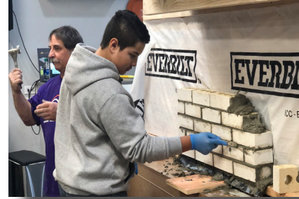
ALLOW A STUDENT TO COMPLETE A ONE-TIME PROJECT