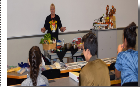
PRESENT TO STUDENTS ABOUT YOUR CAREER FIELD