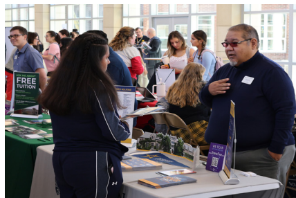
PARTICIPATE IN A CAREER FAIR TO SHARE ABOUT YOUR FIELD