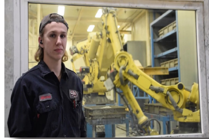
PROVIDE A PAID OR UNPAID INTERNSHIP/APPRENTICESHIP