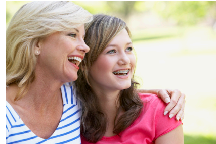
MENTOR A STUDENT (IN PERSON OR VIRTUAL)