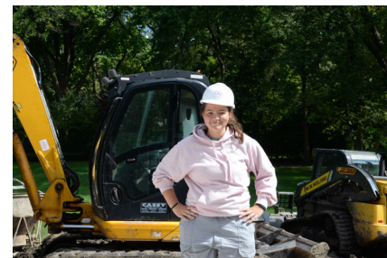
PROVIDE A JOB SHADOWING EXPERIENCE OR A FIELD TRIP VISIT