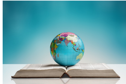
PROVIDE JOB SHADOWING FOR SPANISH-SPEAKING STUDENTS