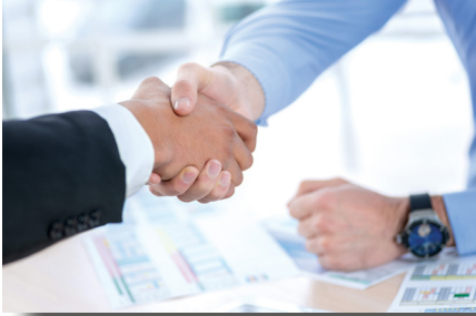
PARTICIPATE IN A CAREER PATHWAY ADVISORY COMMITTEE

D uPage High School District 88 is excited to offer various options for local businesses/companies/organizations to collaborate and partner with the district to support students through work-based learning experiences. Opportunities can be flexible with time and location (including in person, virtual or hybrid) to best fit your schedule. See all the ways you can connect and get involved below!