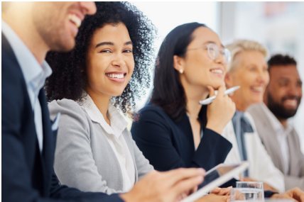
PARTICIPATE IN AN INDUSTRY PANEL/DISCUSSION