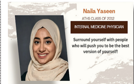
JOIN THE DISTRICT 88 ALUMNI CAREER SHOWCASE