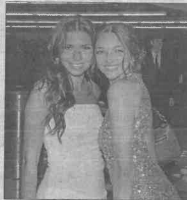
Villa Park Review