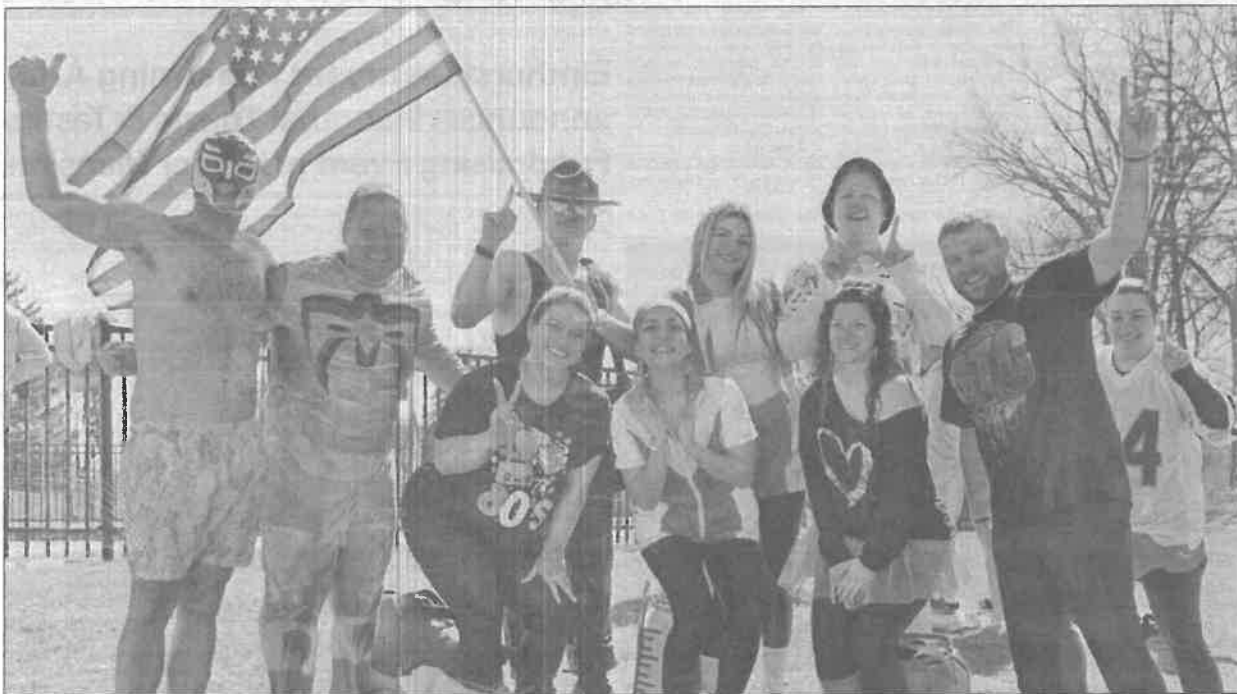
SUBMITTED PHOTO Villa Park Review