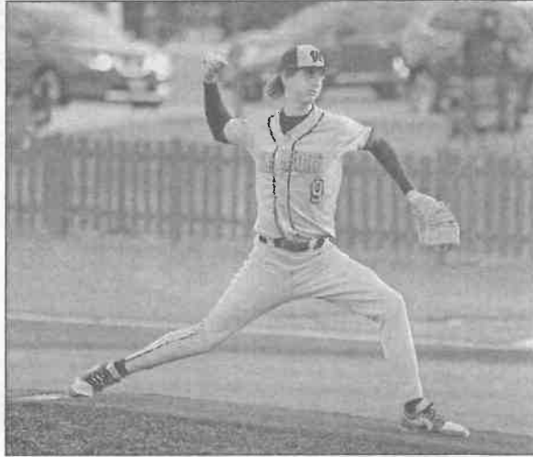
Rock Valley Pub