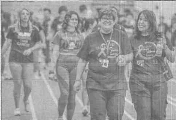
SUBMITTED PHOTOS Villa Park Review