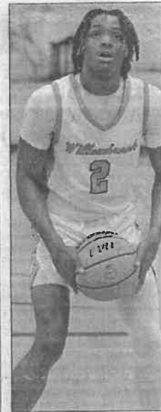
Rock Valley Pub