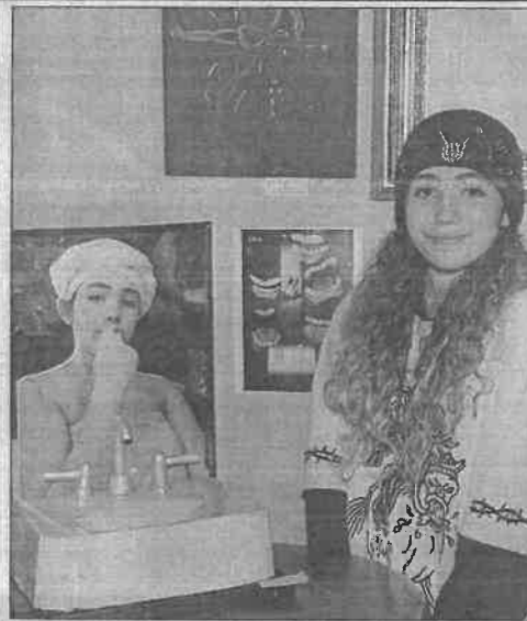
CHRIS FOX PHOTOS Villa Park Review