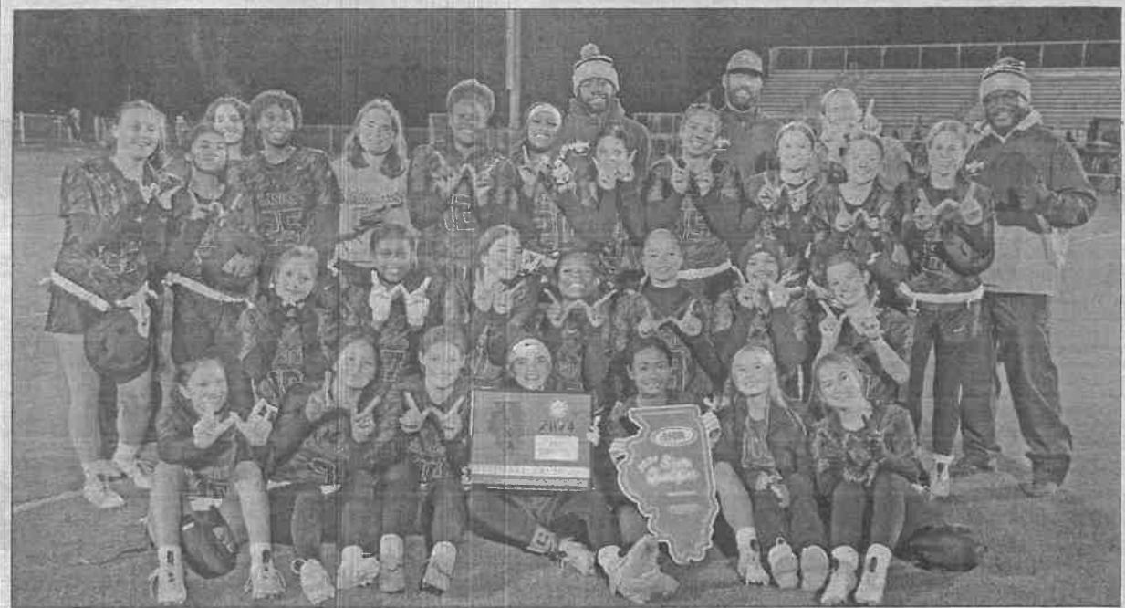
Villa Park Review

VOL. 21 • NO. 45 WWW.THEINDEPENDENTNEWSPAPERS.COM THURSDAY, OCT. 24, 2024