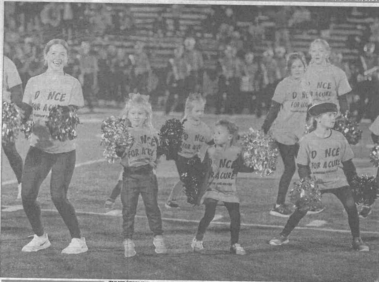
CHRIS FOX PHOTO Villa Park Review