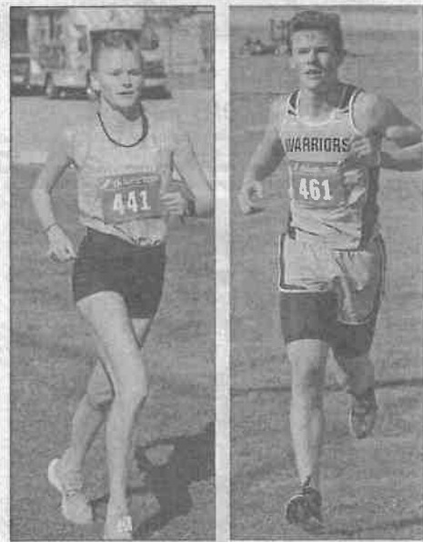
Villa Park Runn

Hi. I get the impression that I death, grotesqueness, the occult violence. Thanks.