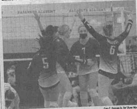
Nazareth players celebrate a point during their match against Joliet Catholic on Oct. 12.