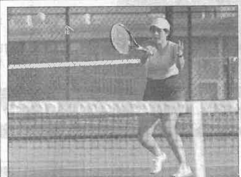
Villa Park Review