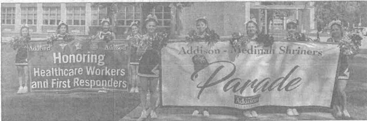
SUBMITTED PHOTO Addison Independent