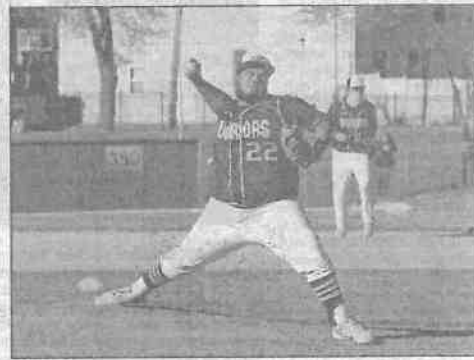
Rock Valley Pub