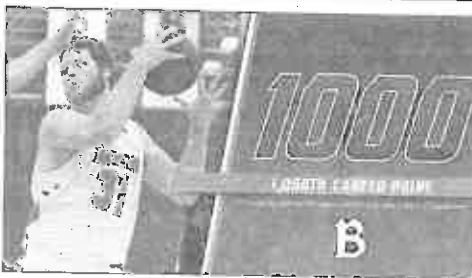
BENEDICTINE ATHLETICS PHOTO Rock Valley Publishing