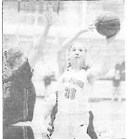
Rock Valley Public

The Warriors' schedule this week includes this Saturday's conference showdown at Proviso East. The Pirates beat the Warriors in the teams' first meeting of the season.