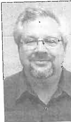
Submitted by Addison Trail Music Department

The nomination process involved providing a summary of achievements, contributions and service, as well as three to five letters of support. Winners are selected by the Awards Committee and the ILMEA Board of