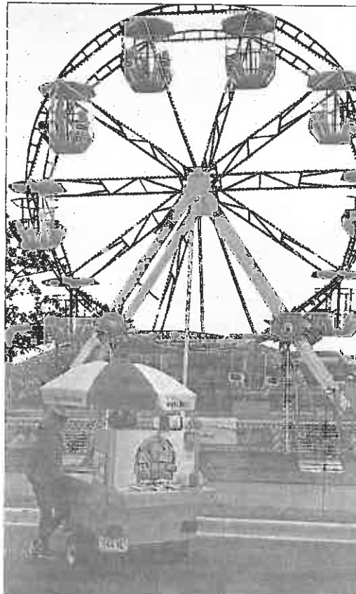
When Clarendale of Addison planned a grand opening event around the theme of the 1893 World's Fair, there simply had to be a Ferris wheel. In addition, items were offered that had originally debuted at the Chicago's World's Fair, such as Vienna Hot Dogs, seen here in the hot dog stand in front.

Join us at the Addison Public Library from 10:30-11 a.m. each Thursday starting Oct. 24 through Nov. 21 for our Spanish/English story time. Have fun listening to your favorite stories and enjoy some activities in Spanish. All ages welcome; knowledge of Spanish is not required. ¡Nos vemos pronto! Info: addisonlibrary.org or call 630-458-3338.