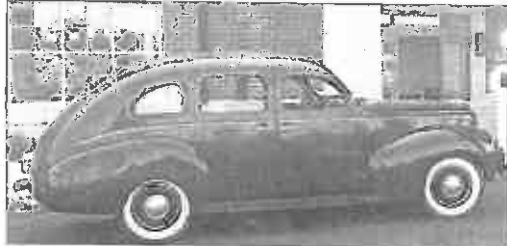
Someone showed up in this old-time vehicle at Clarendale of Addison, who hosted a World's Fair grand opening event on Wednesday, Oct. 9. The event included food and signature cocktails, a casino set-up and live musical entertainment.

To recreate the excitement of the 1893 Midway, Clarendale offered items that had originally debuted at the Fair like Vienna Hot Dogs, Cracker Jack, Pabst Blue Ribbon beer and the Ferris Wheel. Entertainment was also provided by "Harry Houdini," various sketch artists, a belly dancer and others.