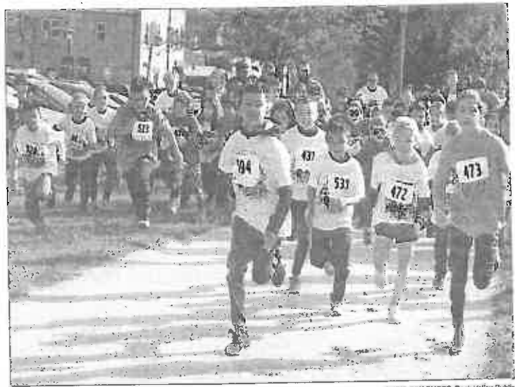
Rock Valley Public

After playing York this week, the Warriors will complete the regular season with conference games against Morton and Proviso East. Willowbrook posted perfect 6-0 conference records in 2017 and 2018.