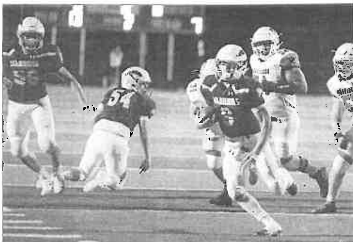
Rock Valley Pub

Willowbrook's next drive ended with a punt. The Celtics eventually punted the ball back to the Warriors, who took possession at their 20-yard line with 3:39 to play. Tumilty was sacked for an