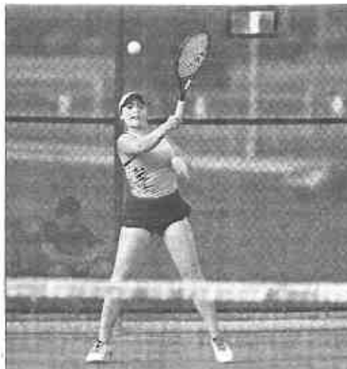
CHRIS FOX PHOTOS © Rock Valley Publishing