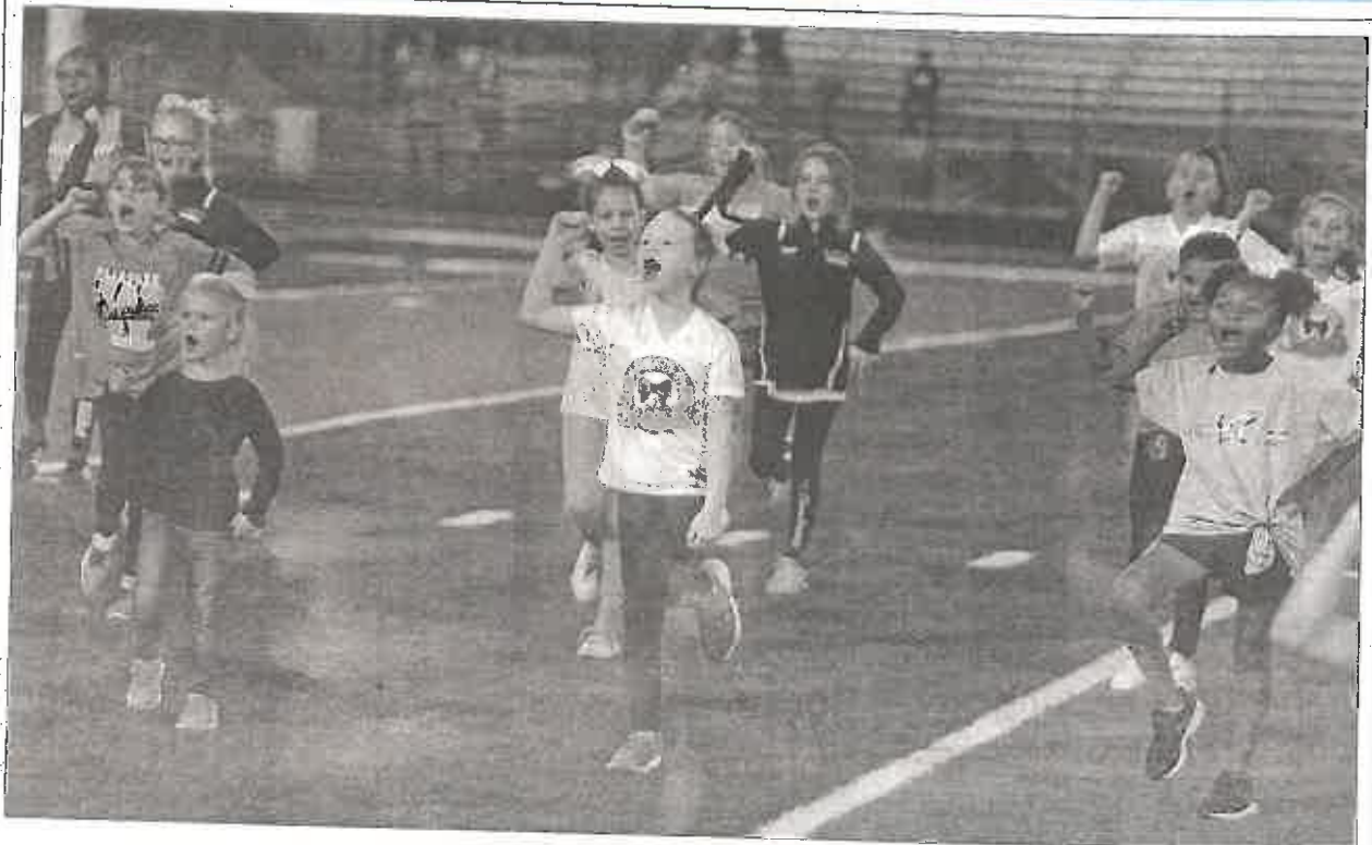
CHRIS FOX PHOTO Villa Park Review