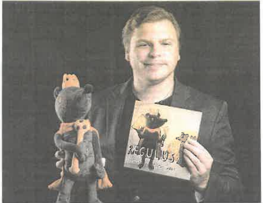
SUBMITTED PHOTO Rock Valley Public

"Regulus" tells the story of three tiny mice, who represent innocence and youth, as they cross paths with the titular character, Regulus, who represents the more troubling moments in life.