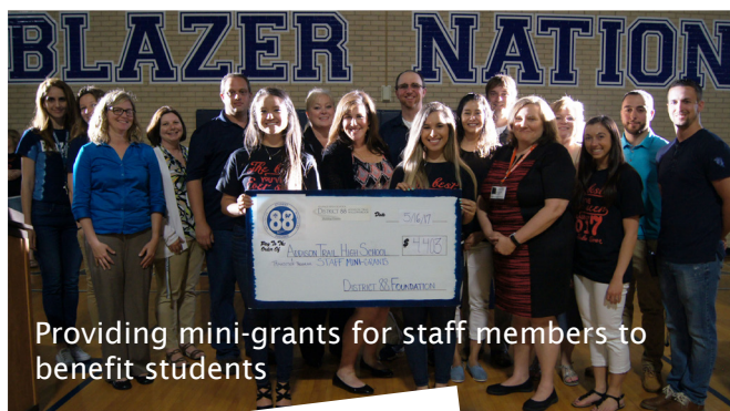
Providing mini-grants for staff members to benefit students