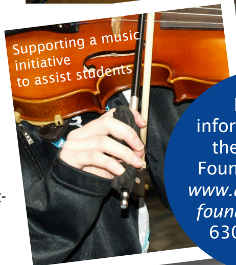
Supporting a music initiative to assist students

For more information about the District 88 Foundation, go to www.dupage88.net/foundation , or call 630-530-3989.