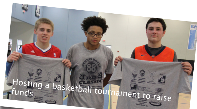
Hosting a basketball tournament to raise funds