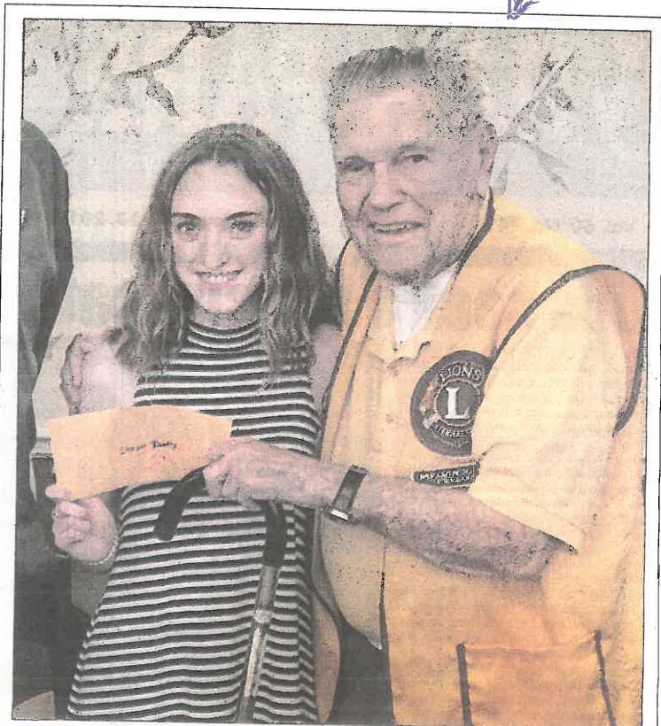
SUBMITTED PHOTO Villa Park Review

In the interest of the project staying on the current construction schedule, it was recommended that the City Council suspend the rules to pass the recommendation at the same meeting. Later in the meeting, the Elmhurst City Council elected to approve and authorize the execution of the IGA.