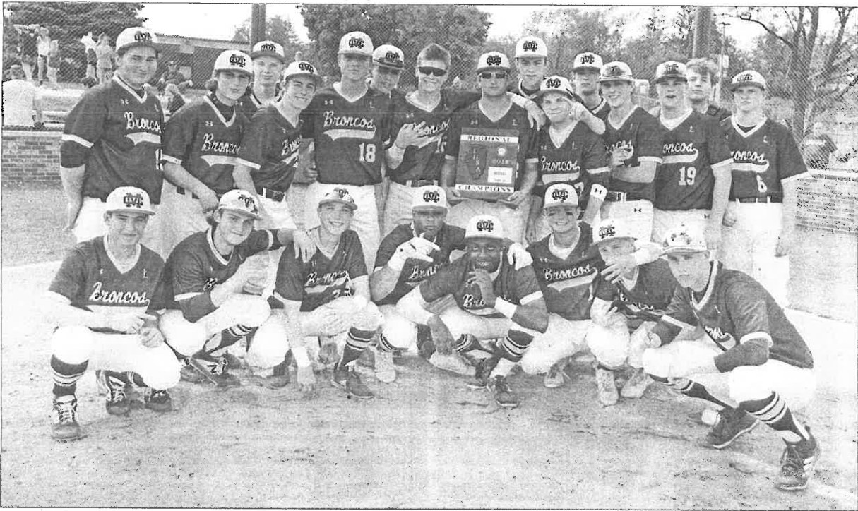
CHRIS FOX PHOTO Lombardian/Villa Park Review