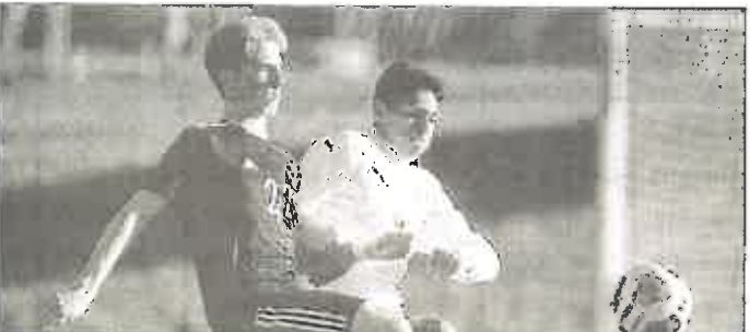
Class 6A St. Charles East regional