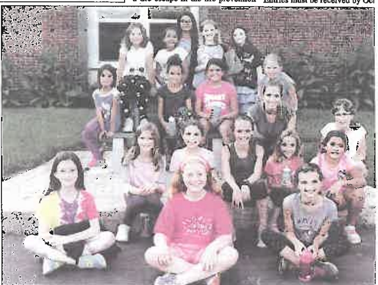
Villa Park

Entry forms for the color contest are available at Villa P Village Hall, the Villa Park Pu Library and at the fire departm Entries must be received by Oct