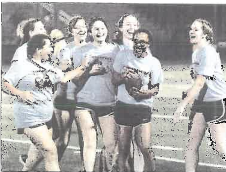
Villa Park Review