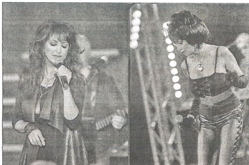
The band Heart To Heartbreaker will perform the music of Heart and Pat Benatar during the Pizza Contest and National Night Out on Thursday, Aug. 7.

who might not be able to afford those items. Items can be dropped off through Aug. 3 at door No. 1 from 7:30 a.m. to 3 p.m. Monday through Thursday and from 7:30 a.m. to 12:15 p.m. on Friday.