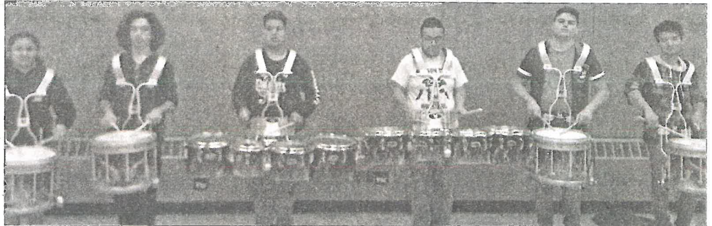
Willowbrook student-musicians (below) rehearse with new instruments they received, thanks to the Young People's Music Initiative Grant, given by the JCS Fund of the DuPage Foundation.