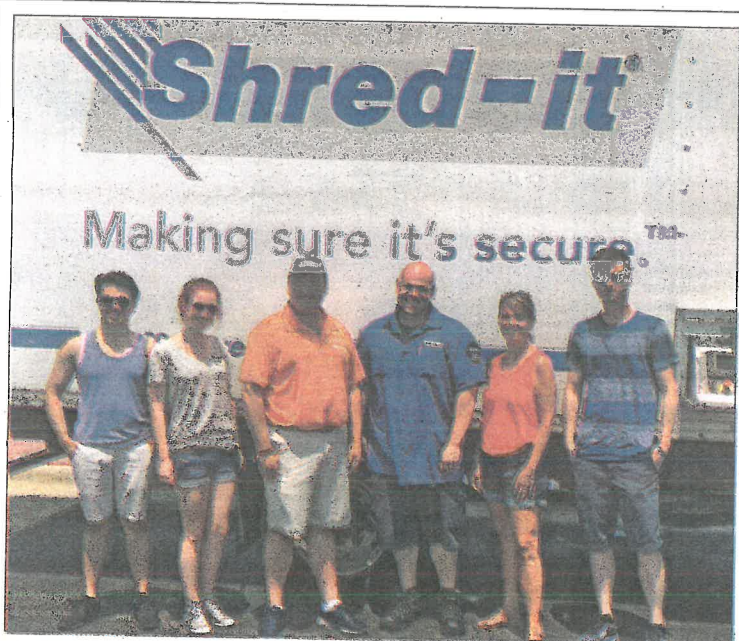
SUBMITTED PHOTO Villa Park Review

The Garden Club of Villa Park will hold its annual garden walk from