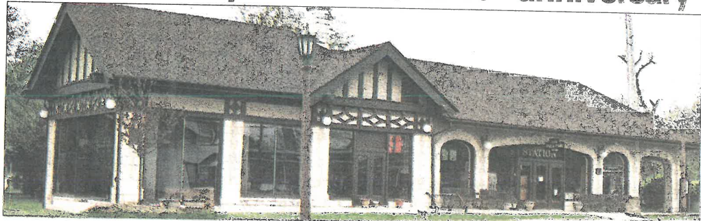
The Villa Park Historical Society is celebrating its 40 th anniversary in 2018. The Villa Park Historical Museum (pictured) was also established 40 years ago. The museum, which once served as a train station, is located at 220 S. Villa Ave. The museum is open from 11 a.m. to 3 p.m. Tuesday through Friday, and from 10 a.m. to 4 p.m. on Saturdays and Sundays.