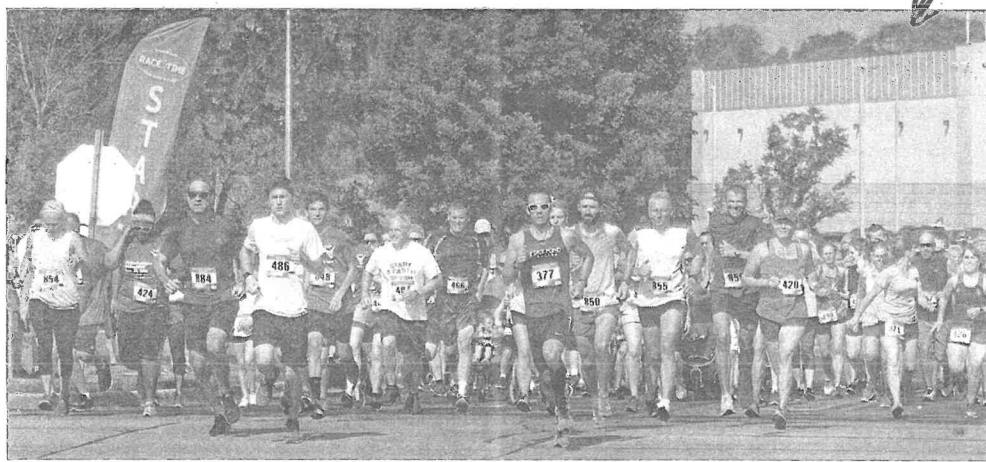
CHRIS FOX PHOTOS Villa Park Review