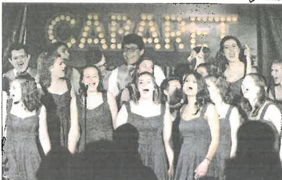
CHRIS FOX PHOTO Villa Park Review