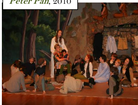
Peter Pan, 2010

Showcase your talents in a performance on the last day!