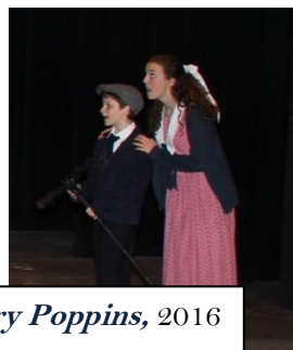
Mary Poppins, 2016