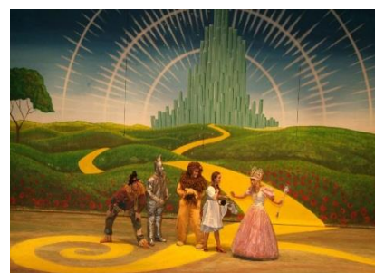
The Wizard of Oz, 2012

https://www.facebook.com/WillowbrookHighSchoolTheatre