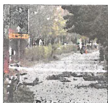
Bicycles and debris lie on a New York City bike path after a driver steered onto it, striking and killing several people.