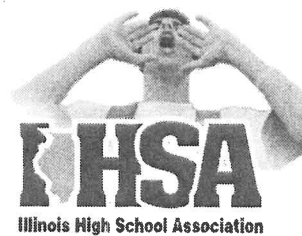
Illinois High School Association