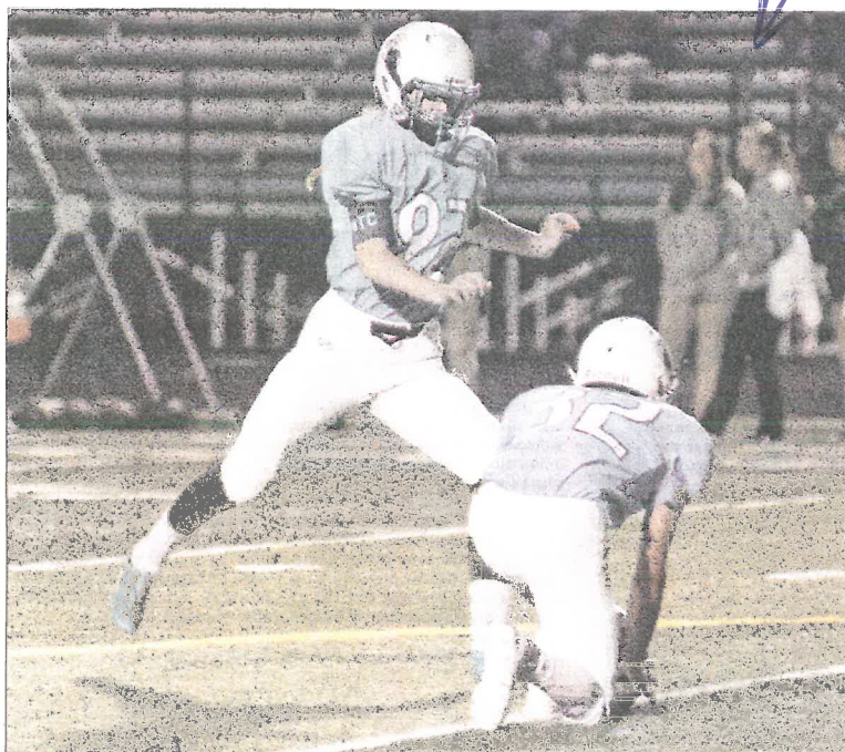
Villa Park Review