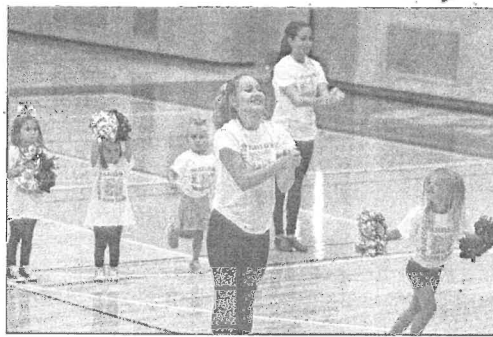
Villa Park Review