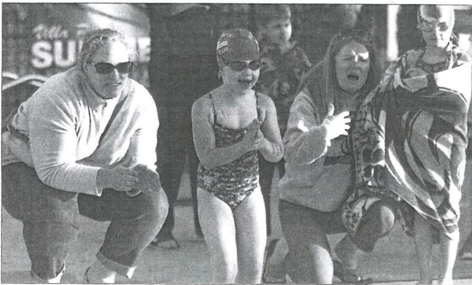
CHRIS FOX PHOTO Villa Park Review