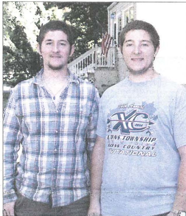
Villa Park Review