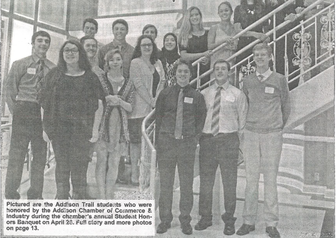
Pictured are the Addison Trail students who were honored by the Addison Chamber of Commerce & Industry during the chamber's annual Student Honors Banquet on April 26. Full story and more photos on page 13.